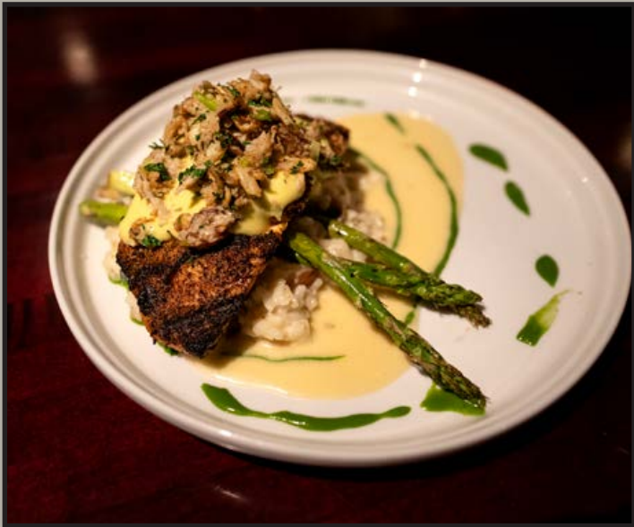
Crabby's Seafood Bar and Grill 815 W. 7th St. • Joplin, MO • 417.206.3474 Catering • Private Parties • Chef at Home

Dine at Crabby's for a beautiful meal in an elegant, yet approachable fine-dining experience. Choose from a wide variety of fresh seafood, steak and chops. Enjoy libations from our full bar, including the best Scotch selection in town. Serving the four states for 10 years! Make your reservations today! $$-$$$