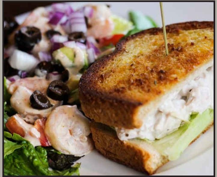
Red Onion Café 203 E. 4th • Downtown Joplin, MO 417.623.1004 • www.redonioncafe.com

Hours: Monday-Saturday 11 am-10 pm • Closed Sunday