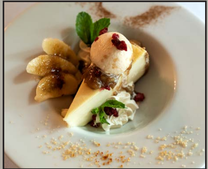
Kascade Steakhouse 988 S. Country Club Rd • Carthage, MO 417.553.7357 • Like us on Facebook!

Hours: Mon-Thurs, 11 am-9 pm; Fri-Sun, 11 am-10 pm; Mon-Wed Lunch Specials, 11 am-2 pm; Mon-Wed Happy Hour, 3-6 pm.