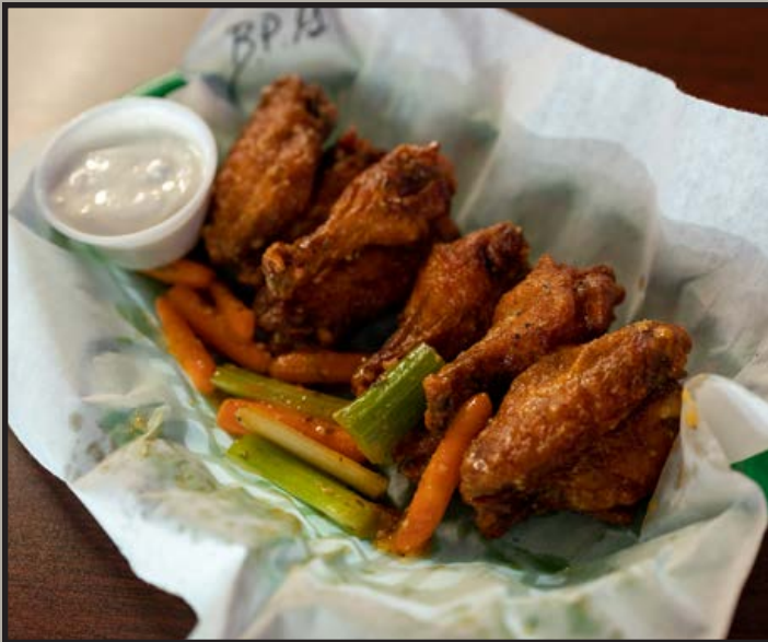
Hackett Hot Wings 520 S. Main • Joplin, MO 417.625.1333 • www.hacketthotwings.com